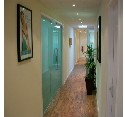
The new facial spa

We also still offer “Take Home” whitening kits if you wish to take more time to whiten your teeth. This process also uses customised trays and it takes about 2 weeks for the full effects to seen.