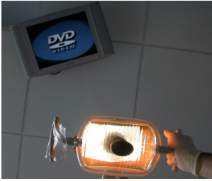
▲ Patient eye view from dental chair

The practice is now fully air-conditioned and we also have a refreshment area. Please feel free to help yourselves to hot or cold drinks on your arrival.