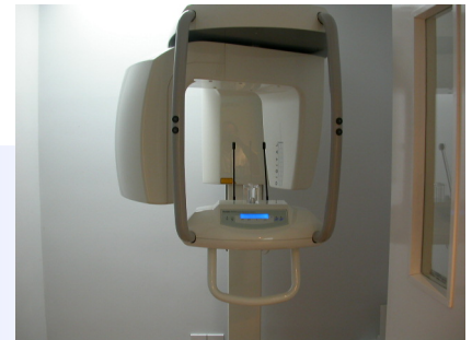
▲ New digital x-ray machine, allows your dentist to see an immediate picture on screen ▼