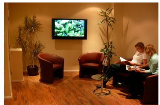
The waiting area

Whilst we had to replace the windows, and redo the electrics and plumbing, we decided that we would take the opportunity to modernise our practice and transport it into the 21st century, whilst keeping the same patient care ethos.